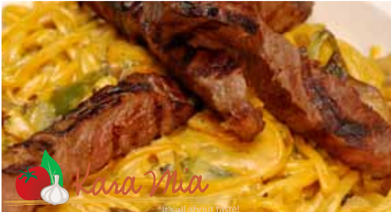
PASTA DE CARNI