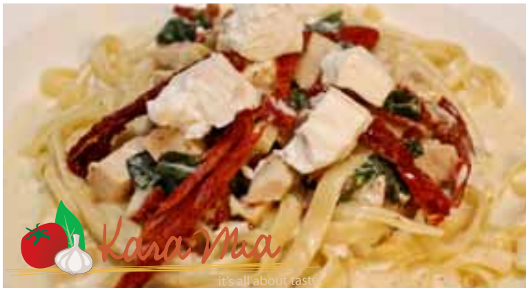
FETTUCINI KARA MIA