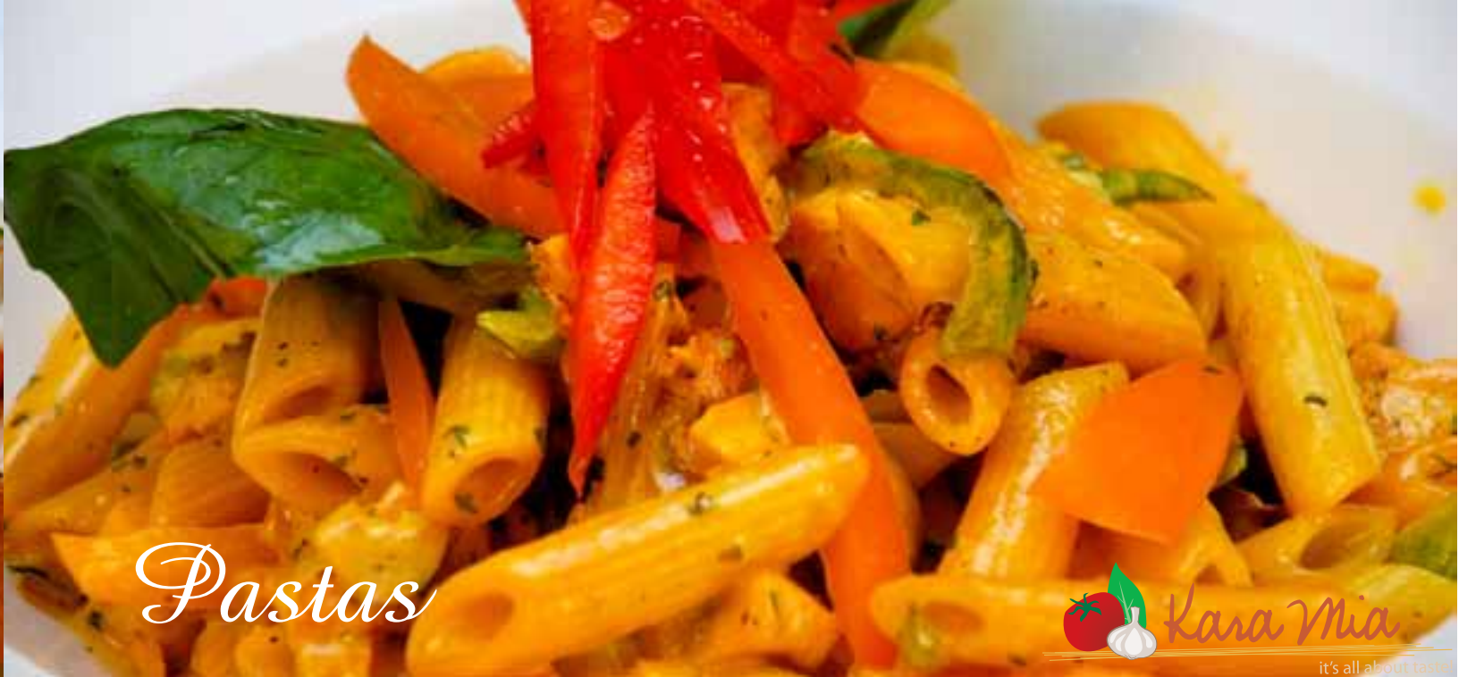
PENNE PICANTE ROSE